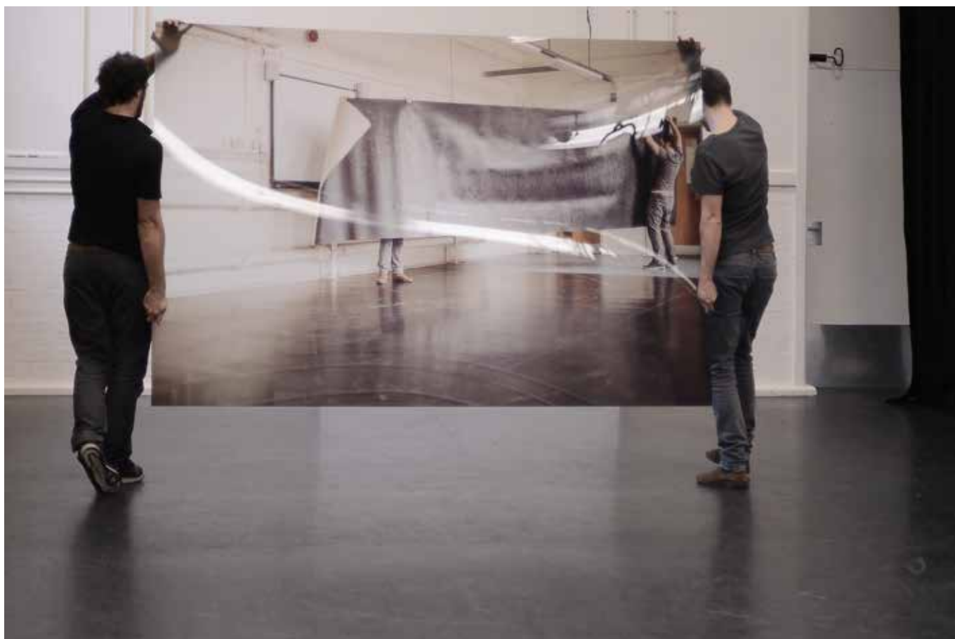
Pétrel | Roumagnac (duo) & Simo Kellokumpu, Reset #2 , 2013

(Music curator, Fundação de Serralves-Museu de Arte Contemporânea)