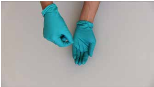
Kapwani Kiwanga, Forms of Absence , 2014

Trained in the social sciences, Kapwani Kiwanga creates protocols that serve as filters for her observation of different cultures and their ability to mutate. Bent on sabotaging hegemonic narratives, she deliberately mistreats the boundary between truth and fiction. In her lecture-performances she constructs scientific narratives drawing on Afrofuturism, science fiction, popular fables and belief systems as a means of comparing the archival and the invisible. Here she assumes the role of a conservator-archivist giving a voice to mute objects, handling invisible objects, and passing on forgotten narratives in which obscure historical facts, strange anecdotes and mythical beasts have their place. In a fusion of readings, sound and video excerpts the artist reconsiders the implications of documentary material and classification, and the potential of oral transmission as a means for envisaging an intangible museum.