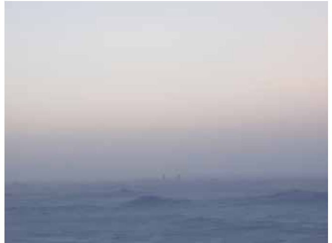
Ellie Ga, Concrete Sea , 2009