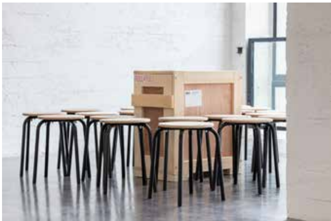
Béatrice Balcou, Cérémonie Sans Titre #06 (Untitled Ceremony #6) , 2015, Wiels

Commissioned by the Centre national des arts plastiques Coproductioin: CNAP, la Galerie, centre d'art contemporain and La Ferme du Buisson.