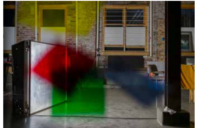
Pétrel | Roumagnac (duo), 201 Full CT Blue (2) , 106 Primary Red , 736 Twickenham Green , 101 Yellow , 2017, courtesy of the artists and the Escougonu-Cetraro Gallery